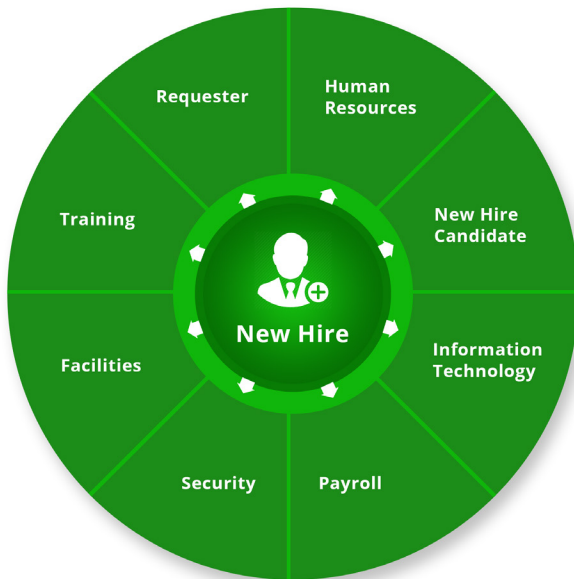
Process a new hire (permanent, full-time, part-time, temp, intern...)

Automation – and “hyperautomation” – are obvious trends. It's hard to find a company not looking at processes it can automate according to Gartner's Top 10 Strategic Technology Trends For 2020.